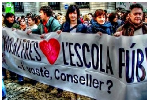
SPAIN: 'Spain: a red-hot spring in defence of state education'. Education unions along with parents' and students' associations have called for a strike in Spain on May 22. The strike will make history, covering the whole education sector from Early Childhood Education up to university. The consequences of these policies will have a direct impact on the quality of the state education service. They will lead to, among other things, cuts in staff levels, overcrowded classrooms, a standstill in the creation of new vocational training courses, the privatisation of education services, increased university fees, fewer scholarships, and a loss of labour rights for teaching staff.

Global Campaign for Education (2012) France: Demonstrations against privatisation in education. http://www.campaignforeducation.org/en/news/education-news/275