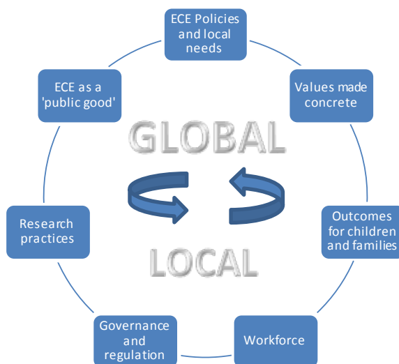
Figure 2 - Aspects of privatisation: dimensionality and interrelationality.

Figure 2 illustrates a dynamic process of critical thinking regarding different topics included in the survey which aims to generate understandings of the impacts of privatisation in ECE in 14 different contexts throughout the world.