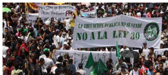
COLOMBIA: 'El cara y sello de la reforma a la educación'. [The heads and tails of the education reform] Profesores y estudiantes buscan evitar el trámite del proyecto de reforma de la educación, por considerar que "la privatización acabaría la educación pública". [Teacher and student unions in Colombia are seeking to torpedo the enactment of the education reform because they consider that 'Privatisation could dismantle public education']

Education International News Spain: a red-hot spring in defence of state education (16 May 2012) http://www.ei-ie.org/en/news/news_details/2164