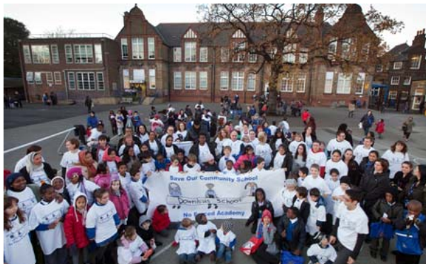
ENGLAND: The government has come under renewed attack for trying to force Downhills primary school in north London, to turn into an academy.