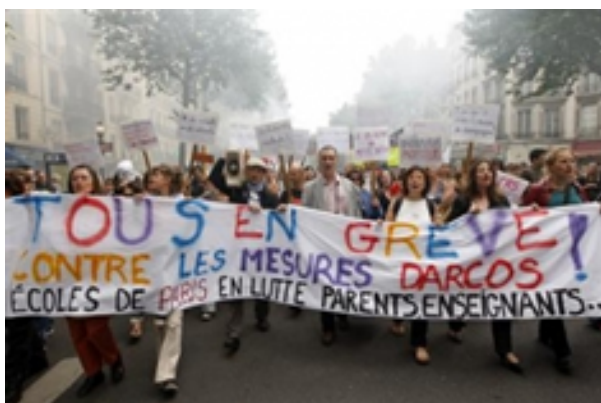
FRANCE: Demonstrations against privatisation in education. Thousands of students, parents and teachers took to the streets in France again to protest against the Government's proposed education reforms. The movement is demanding in particular that the University Reform laws recently voted by Parliament be scrapped. This new legislation is part of a move towards what is called "autonomy" of universities but what teachers, Unions, and students denounce as privatisation reforms which undermine public education and weaken collective rights and teacher status.

Global Campaign for Education (2012) France: Demonstrations against privatisation in education. http://www.campaignforeducation.org/en/news/education-news/275